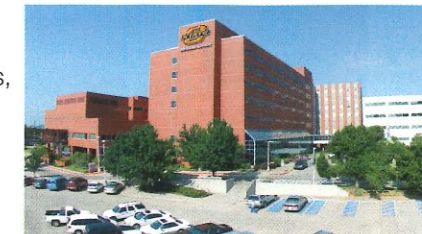
OSU Medical Center

In December, an agreement to maintain a graduate medical education program at OSU Medical Center was announced by Gov. Brad Henry. Under the agreement, Ardent Health Services, which owns the hospital, will donate the facility to a city trust, which will contract with St. John Health System to operate the hospital. OSU is committing $45 million -- $20 million in funds previously appropriated for our residency program now will be used to help the hospital get back on its feet financially, plus $25 million to support the first phase of much-needed capital improvement projects. In addition to the $45 million commitment from OSU, the hospital will receive $8 million from the state the first year, followed by $5 million per year in the subsequent four years; plus a combined $7 million per year for five years from the Kaiser Family Foundation and St. John Health System.